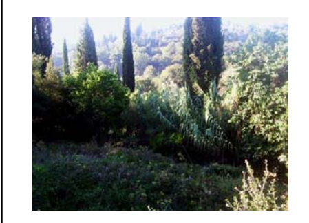
Agios Ioannis - Panorama

This superb two stremmas is situated in the heart of Agios Ioannis, and yet is secluded with unbroken views over the valley below. There is permission to build up to two dwelling houses on this site but one house only may be the solution. Utilities are close at hand, as are schools, shops and easy access to Corfu town.