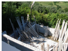
Precipice pool construction