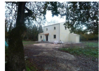
Beautiful Brook Meadow