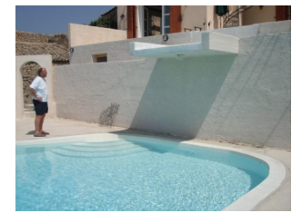
The Gem pool with owner