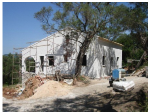
Villa Aphrodite Construction