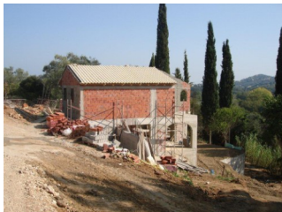
Panorama East construction