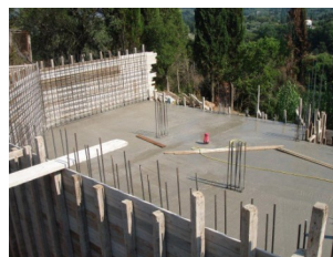
Concrete and Steel