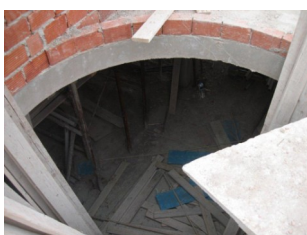
Forming of a spiral oak staircase