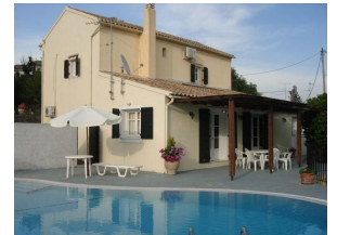
Villa Theodora With over-flow pool