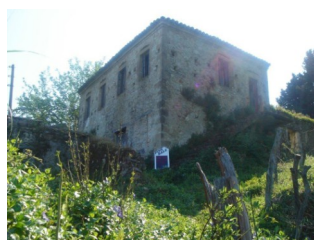
The next development?