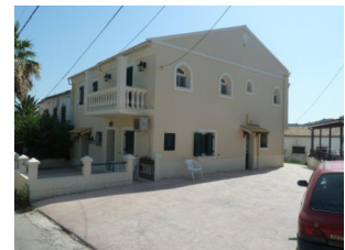
Sofia's Villa - Agios Ioannis