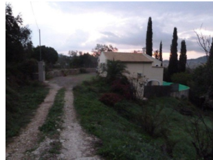
Panorama East early dawn