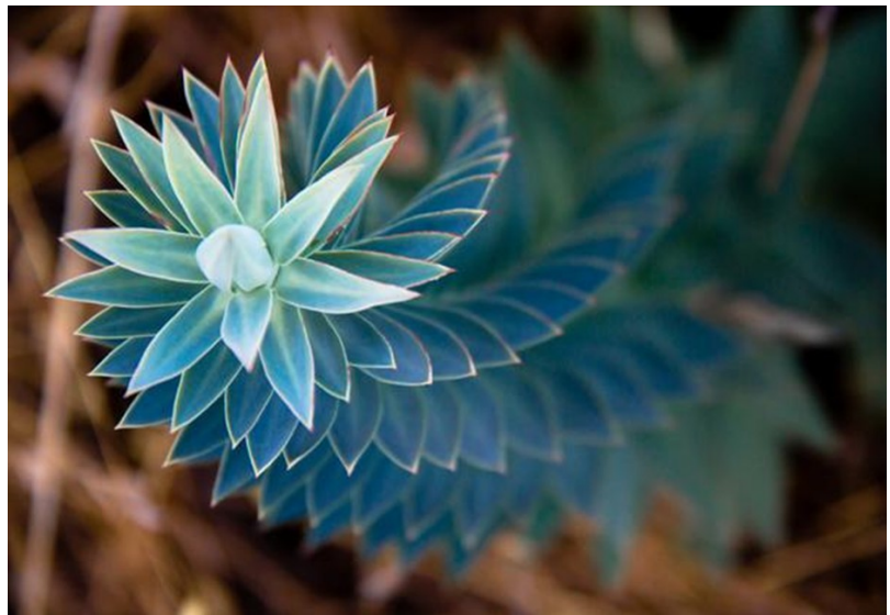
A flower on the Greek island of Lesbos.

But If we are bold and wise, then we can truly, be rich.